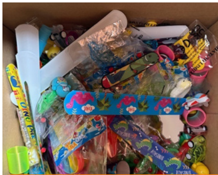
Raffle tickets and prizes for our wonderful Year 6 pupils to celebrate hard work, resilience and great learning!