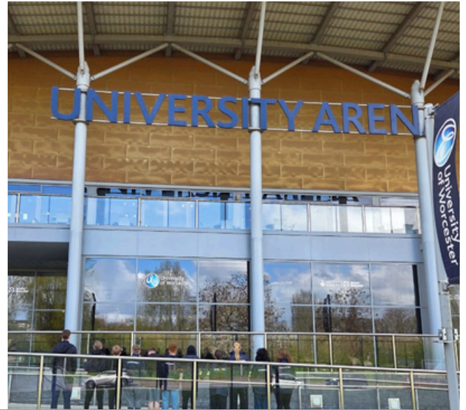
Sports leaders with Worcester Wolves Ladies Wheelchair Basketball Team at The Worcester University Arena