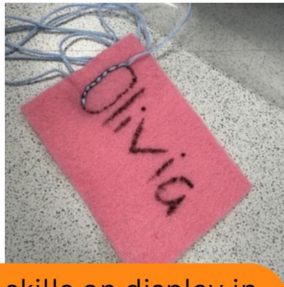
Excellent stitching skills on display in Art.