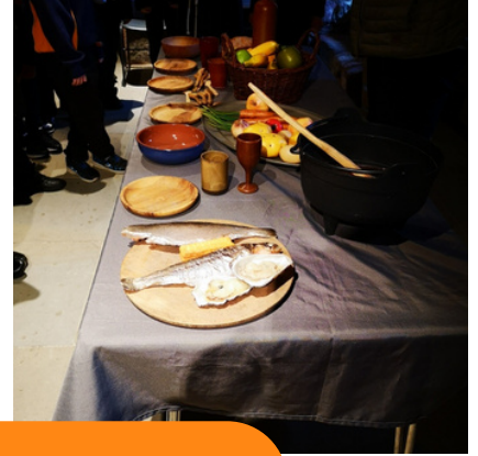
Year 5 visit to Worcester Cathedral