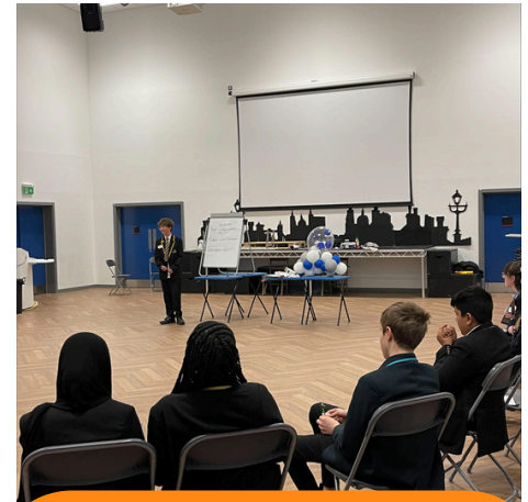
Student leaders at Waseley Hills taking part in Talk the Talk training.