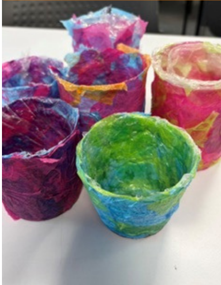
Year 5 decoupage pots