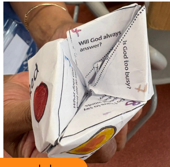
Activities in prayer club