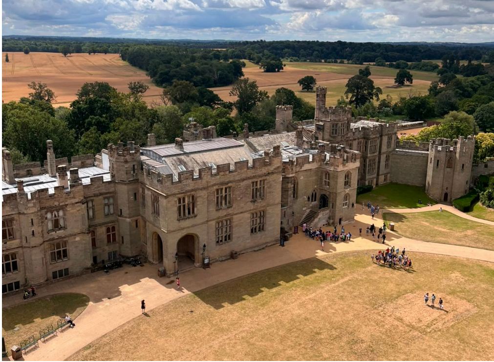
Year 6 visit to Warwick Castle