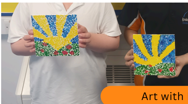
Art with Kip McGrath!