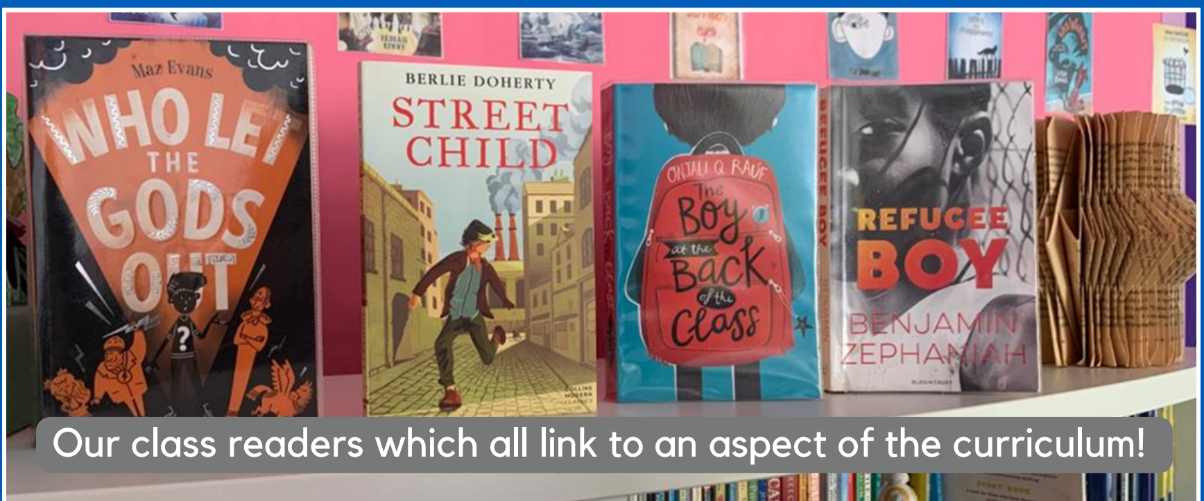
Our class readers which all link to an aspect of the curriculum!